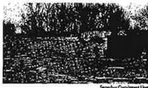
Secondary Containment Liner