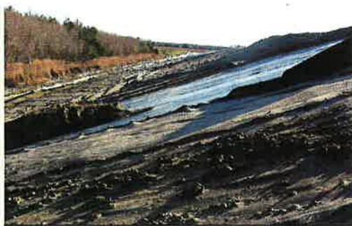
Photo 1. Initial slope failure.

The ability to construct the side slopes of the panhandle bottom-up was compromised by both the tight property lines and the presence of a large gravel drain at the toe of slope. This detail is shown in Figure 1. The property line was only 5 ft. from the edge of riprap for much of the perimeter.