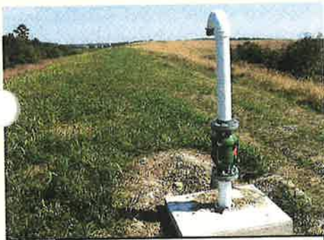
Photo 5. Final cover today.

The contractor did not believe that it was possible to construct and then remove a construction road around the base with this drain present.