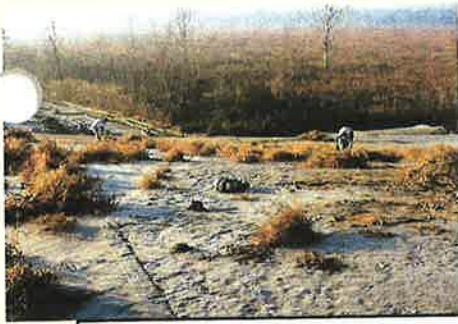
Photo 3. Invasive grass in exposed geotextile.