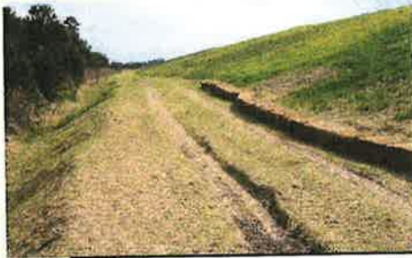
Photo 4. Perimeter roadway.