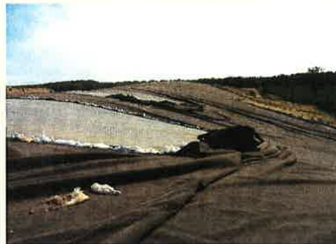
Photo 2. UV degradation of drainage composite.